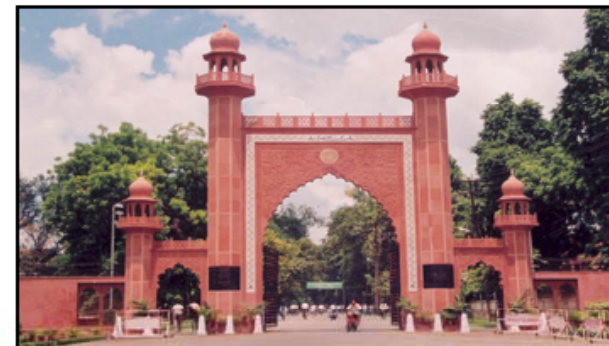
Main Gate of AMU

Feel free to explore this website and use the various services provided on the website. Our aim is to make Aligarh Nagar Nigam , a citizen friendly local body in India. We are implementing Information and Communication technologies to the full extent and this website forms part of our efforts to make Aligarh Nagar Nigam , an IT savvy local body in India.