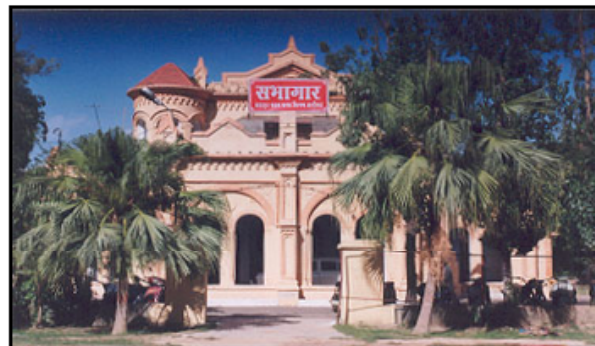
Sabhagar-Aligarh Nagar Nigam

We, the members of Aligarh Nagar Nigam welcome you to our official website. This website is part of the Information Technology related initiatives of Aligarh Nagar Nigam .